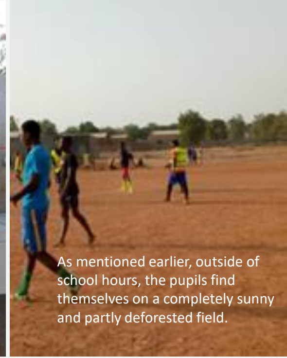
As mentioned earlier, outside of school hours, the pupils find themselves on a completely sunny and partly deforested field.